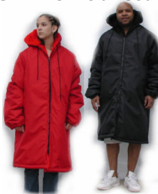
Elite I Gold