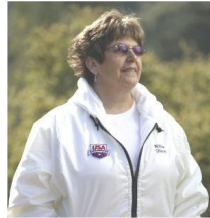
Swim Official Coat